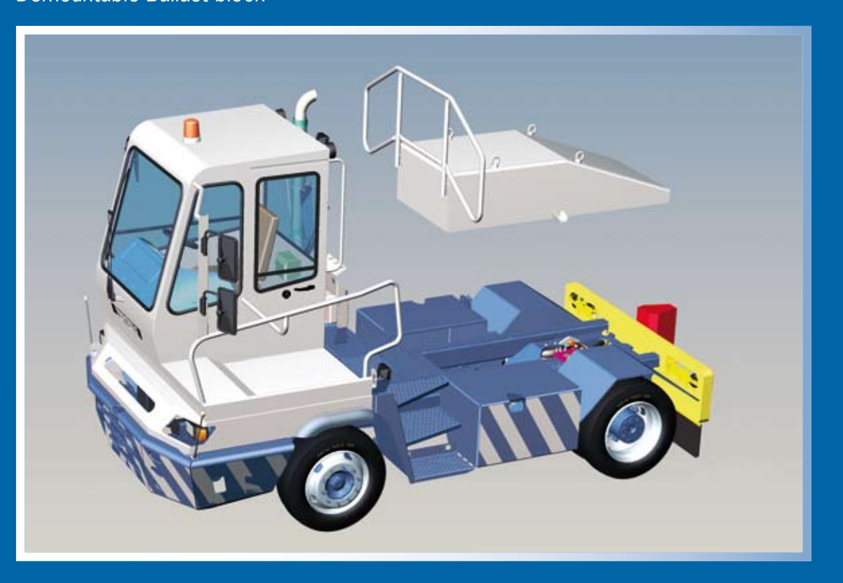
Special drawbar coupling and camera system to inform the driver