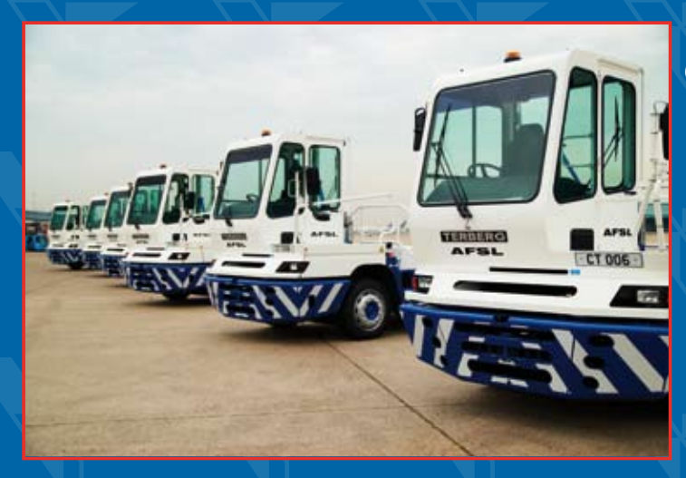
7 units Terberg tractors delivered to Air France/KLM