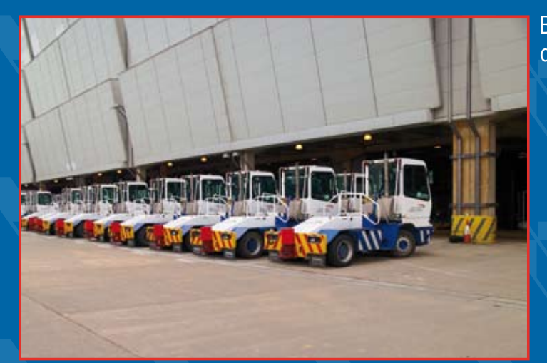
Batch of Terberg tractors delivered to British Airways