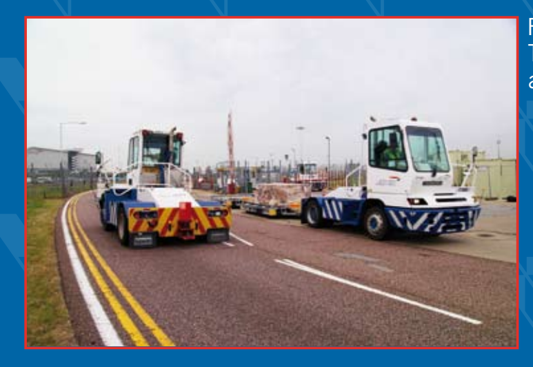
Front- and rear view of Terberg tractors in operation at Heathrow Airport in London