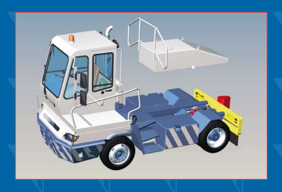
Special drawbar coupling and camera system to inform the driver