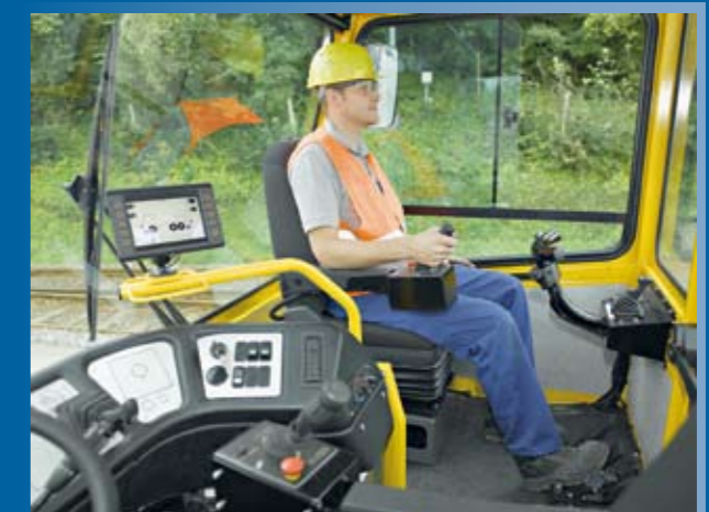
The interior cabin space offers a high degree of comfort and an excellent working environment for the driver.