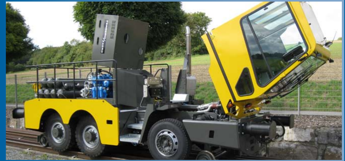
Easy access for maintenance.