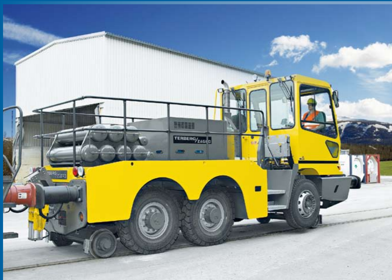
View TERBERG/ZAGRO locomotive tractor from the rear side.